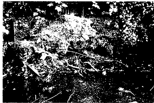
Makeshift retaining walls were found in neighborhood yards.