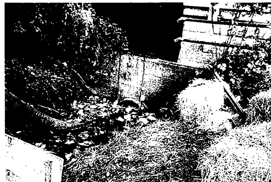
Check dams were placed in sections of the brook, and water was routed downstream of restoration activities through the use of hoses, pumps, and piping.