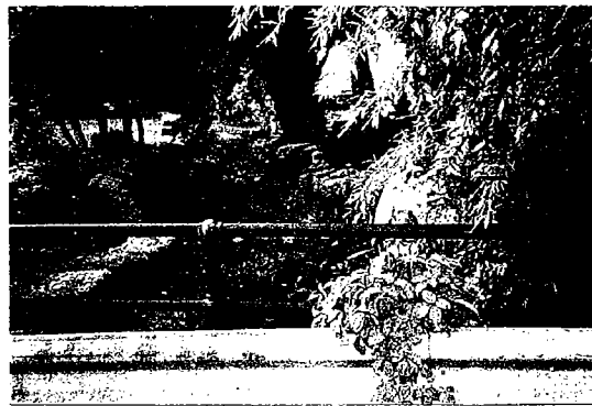
Erosion control measures were put in place after clearing and grubbing in the channel corridor.