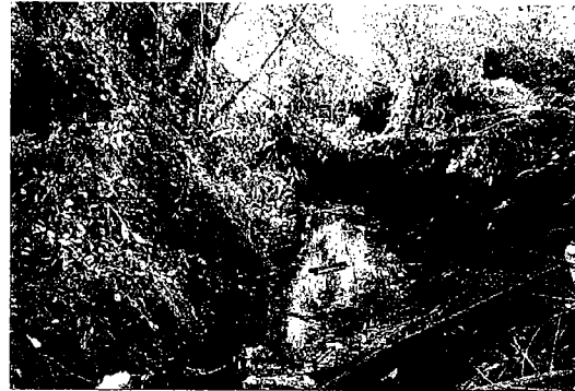
Debris was found in and near the brook.